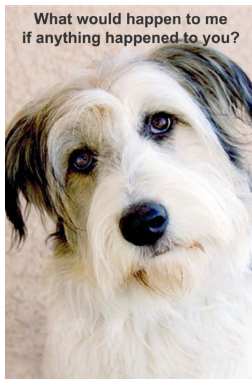
What would happen to me if anything happened to you?

More than 500,000 pets are relinquished and euthanized in shelters when their human companions die or become disabled. 2nd Chance 4 Pets works with pet owners across the country to help them plan appropriately for the lifetime care of their pets.