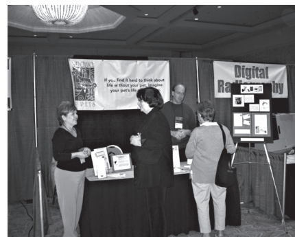
2nd Chance Volunteers participated at a recent animal care conference meeting with members of animal welfare and animal control organizations

A very special THANK YOU to Animal Welfare Trust who has made it possible for us to launch our literature campaign allowing us to distribute information to help pets and their human companions across the country. Together we will help prevent our animal companions from being orphaned due to the death of their human companions. We will bring peace of mind to pet owners and reduce the burden to animal shelter and rescue groups.